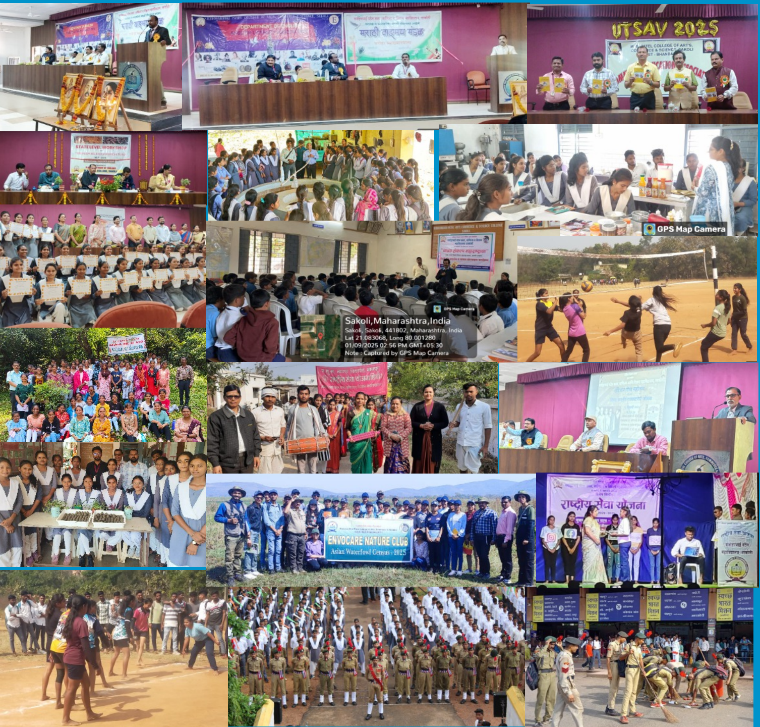
Sakoli, Maharashtra, India Sakoli, Sakoli, 441802, Maharashtra, India Lat 21.083068, Long 80.001280 01/09/2025 02:56 PM GMT+05:30 Note - Captured by GPS Map Camera