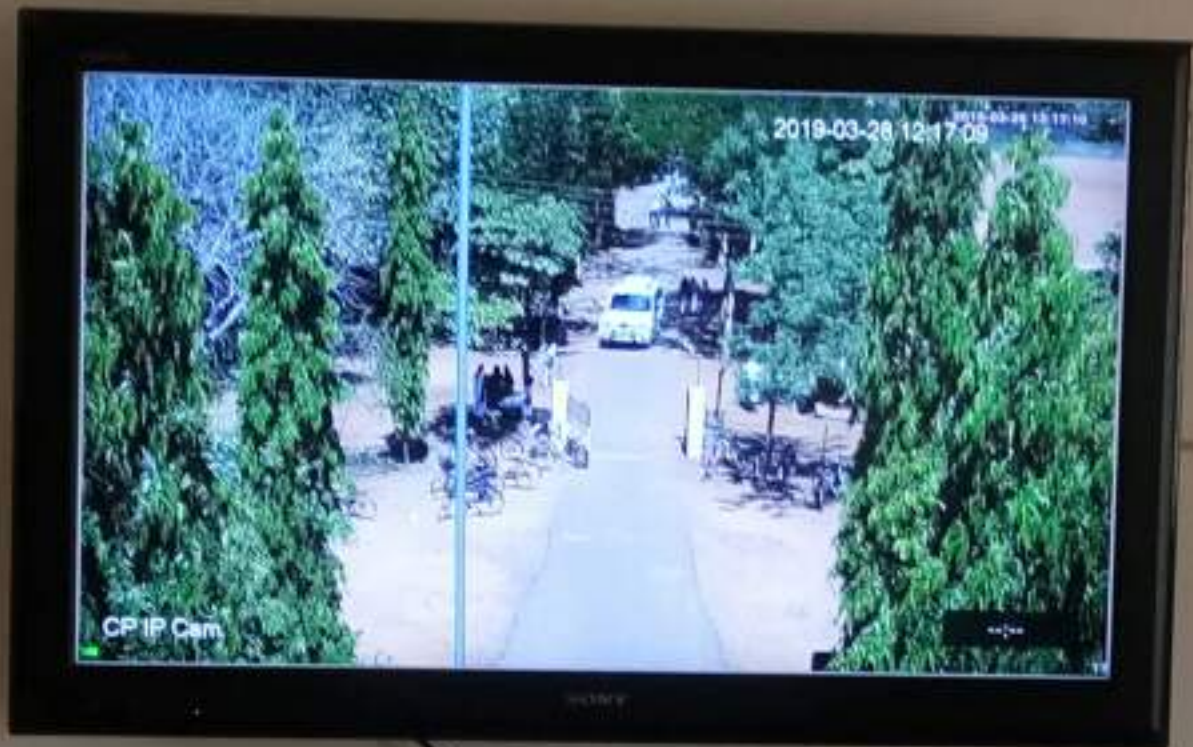
SINGLE CCTV CAMERA ON DISPLAY IN PRINCIPALS CABIN