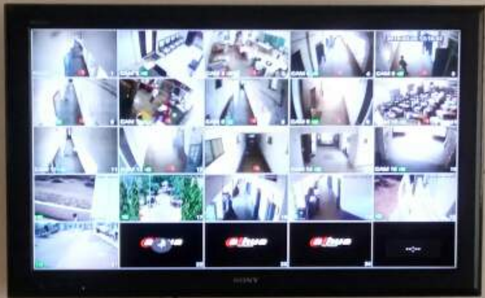
CCTV DISPLAY IN PRINCIPALS CABIN